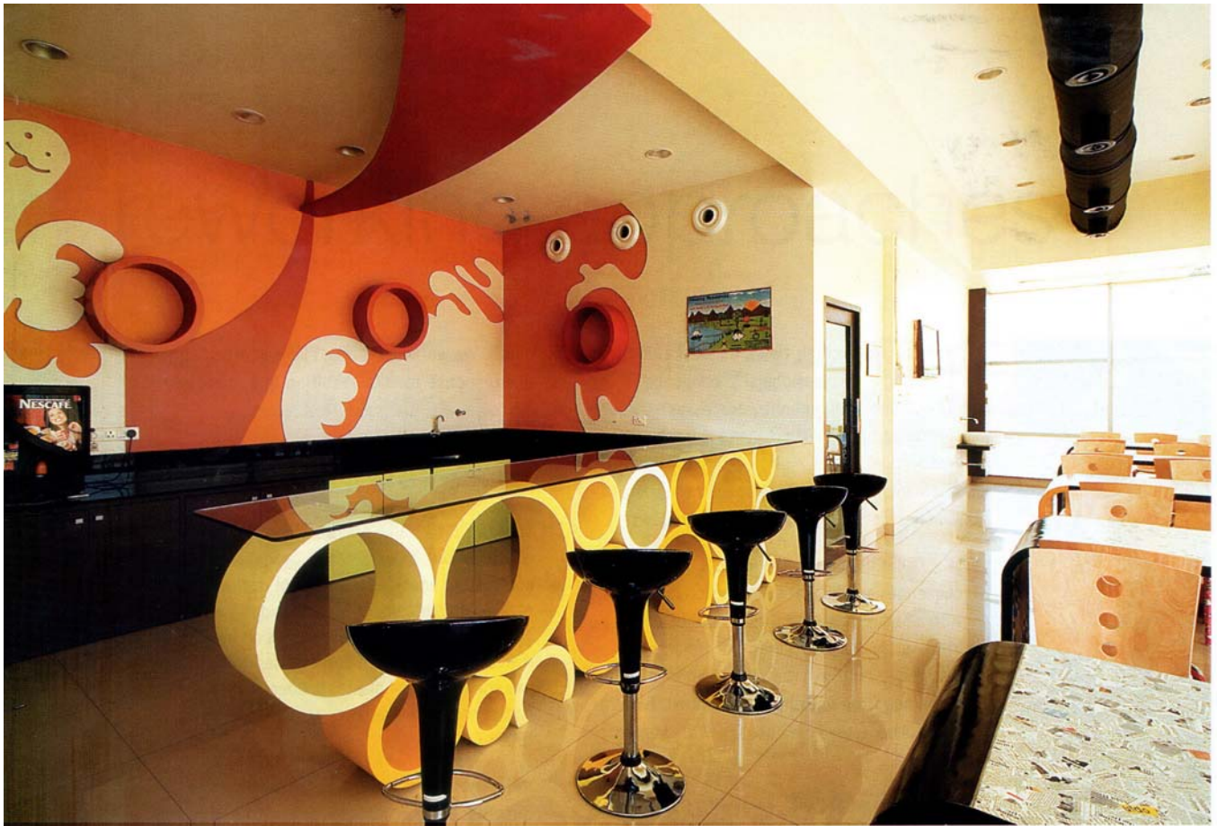
Cafeteria, Gunneto Corporate office

across the globe at dizzying speeds. Many of these hit us and we ensure in time application. Interconnectivity within a globalised design community is a reality. However, global vision stays anchored to local context; we draw from local cues as much. It is this ability to marry local to global that in some ways defines our work.