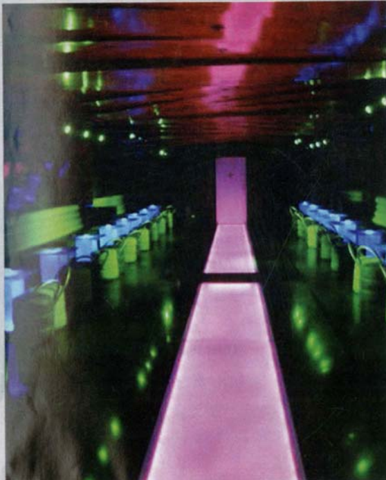
Night Lovers Pub