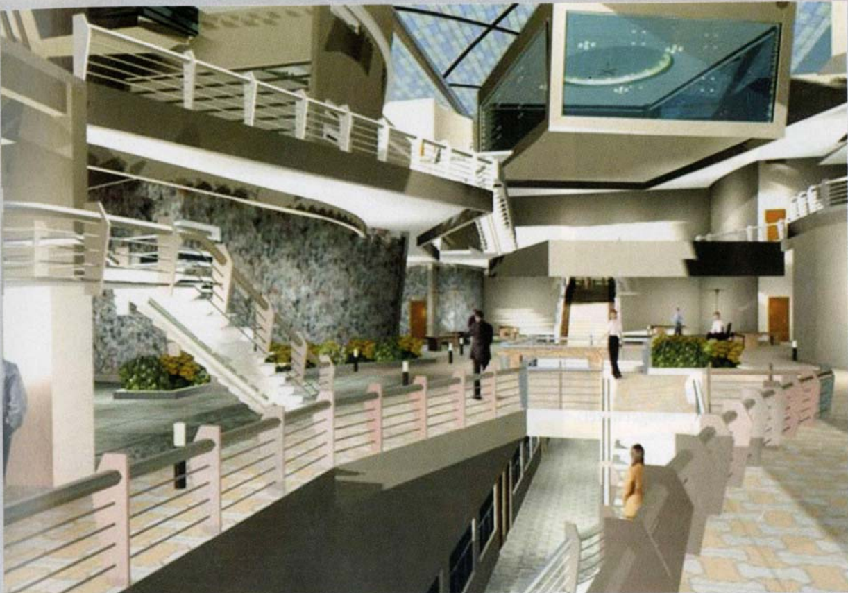
Vidyalankar Engineering College