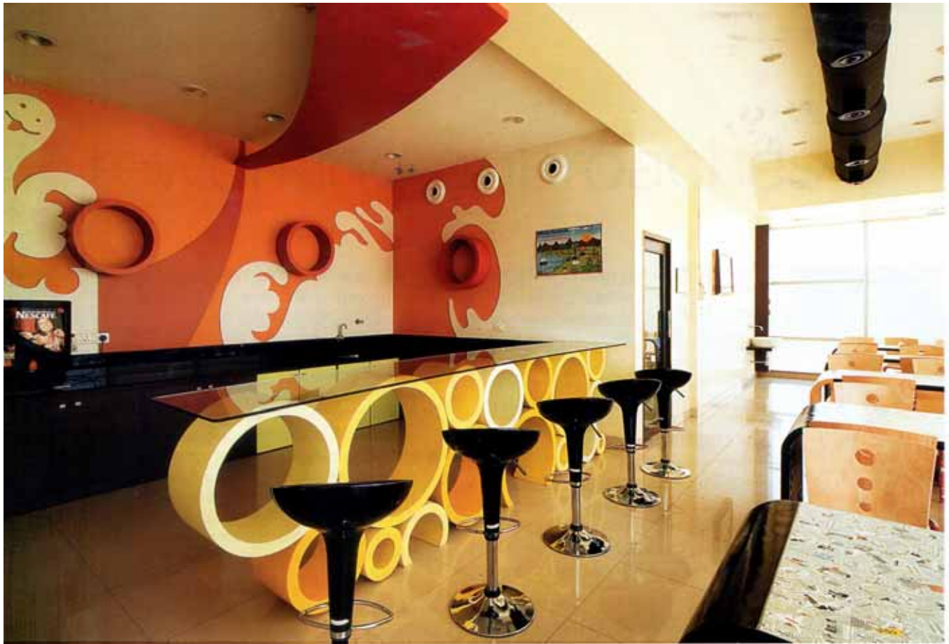
Cafeteria, Gunneto Corporate office

across the globe at dizzying speeds. Many of these hit us and we ensure in time application. Interconnectivity within a globalised design community is a reality. However, global vision stays anchored to local context; we draw from local cues as much. It is this ability to marry local to global that in some ways defines our work.